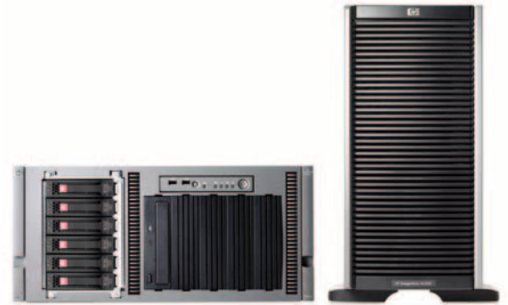
HP StorageWorks 600 All-in-One Storage System