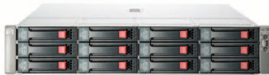
HP StorageWorks 1200 All-in-One Storage System