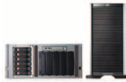
HP StorageWorks 600 All-in-One Storage System