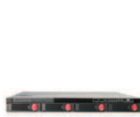
HP StorageWorks 400 All-in-One Storage System