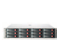
HP StorageWorks 1200 All-in-One Storage System